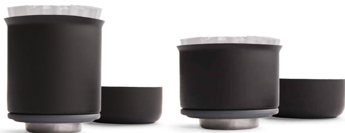
Stagg XF Dripper SKU: FP1108