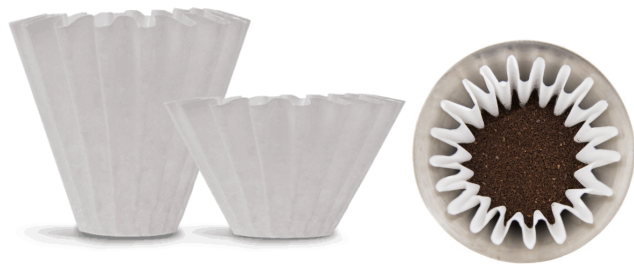
XF Filters | X Filters SKU: FP1129 | SKU: FP1133