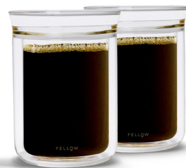
Stagg Tasting Glasses -2pk SKU: FP1110