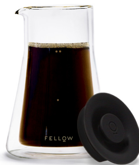
Stagg Glass Carafe SKU: FP1109