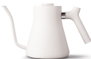
Stagg Matte White SKU: FP1172