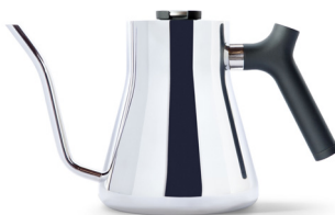
Stagg Silver SKU: FP1042