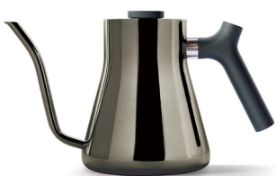
Stagg Graphite SKU: FP1139