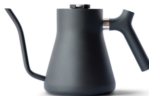
Stagg Matte Black SKU: FP1043