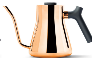
Stagg Copper SKU: FP1102