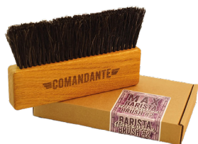
#2 Brush - Beech Wood COM-1802-BEECH