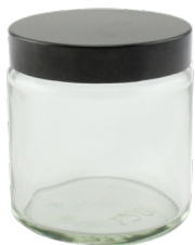
Spare Bean Jar - Clear CHGBJ4PK-CLEAR (4 Pack)