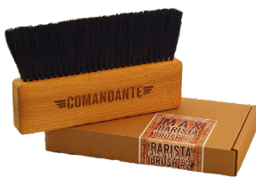
#2 Brush - Oak Wood COM-1802-OAK