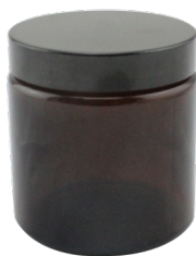
Spare Bean Jar - Brown CHGBJ4PK-BROWN (4 Pack)