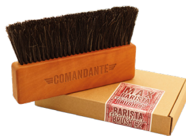
#2 Brush - Pear Wood COM-1802-PEAR