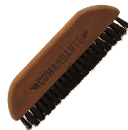
#1 Barista Brush COM-1800