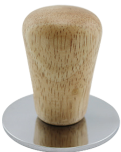
SC25P-TAMP Bellman CX25P Tamper