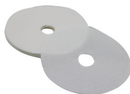
CS25P-FILTERS Bellman CX25P Filters