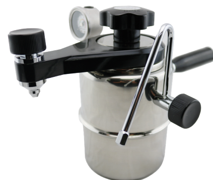
CX25P Bellman SS Stovetop Espresso Maker and Steamer

The CX25P features a pressure gauge that lets you know exactly when the pressure has built up enough to brew a balanced espresso shot, and when to finish the extraction.