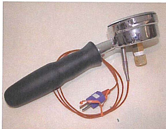
Fig. 2 Portafilter thermometer side view, showing the thermocouple probe's exit through the bottom of the portafilter, and the brew water metering orifice.